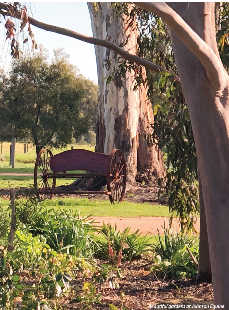
Beautiful gardens at Johnson Equine