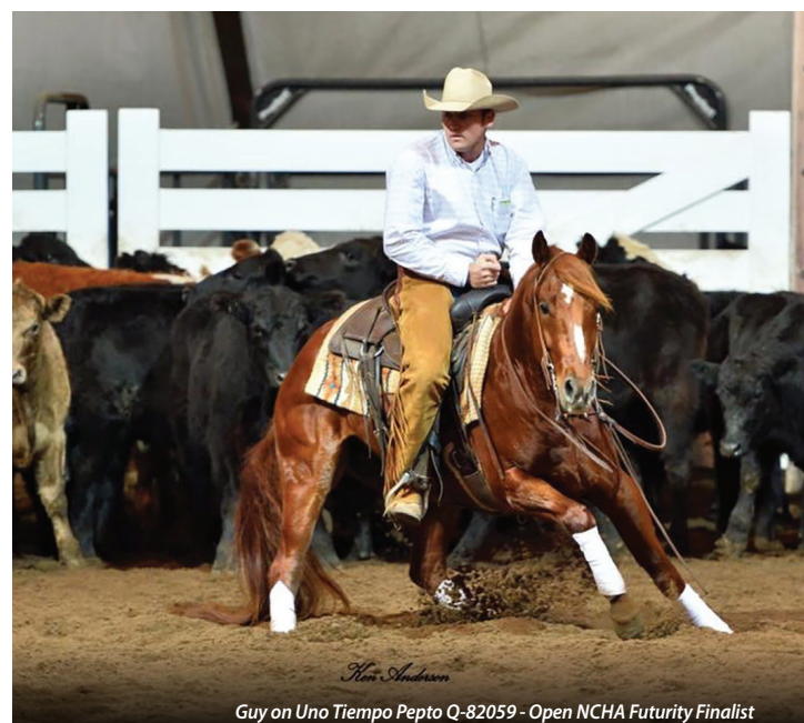
Guy on Uno Tiempo Pepto Q-82059 - Open NCHA Futurity Finalist