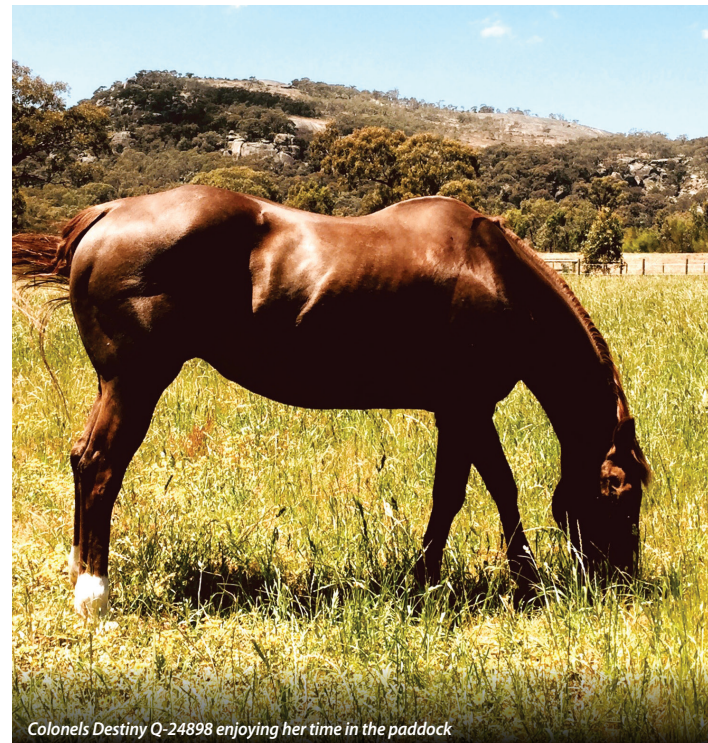
Colonels Destiny Q-24898 enjoying her time in the paddock

Their broodmare quality is top shelf, one special mare that is the matriarch of their breeding is a great one. No other than 2019 Heritage Hall of Fame inductee 'Colonels Destiny Q-24898.' By 'Cuttabars Colonel IMP' out of the great imported mare 'Bit of Pep (IMP)'. Both her parents are champions themselves and have gone on to produce. 'Colonels Destiny Q-24898' has achieved many accolades, winning Futurities, Derbies, and the Australian Quarter Horse Association (AQHA) Championships, to name a few, she holds a special place in their hearts as being that 'special' one. Her progeny are impressive; to date 'Colonels Destiny Q-24898' has produced 18 foals of which 14 are NCHA money earners of more than $200,000.