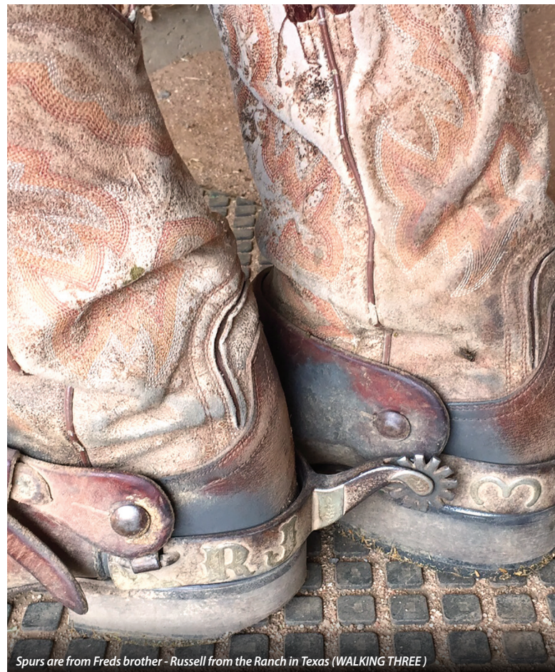
Spurs are from Freds brother - Russell from the Ranch in Texas (WALKING THREE)